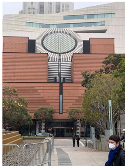
Gallery of Modern Art, San Francisco