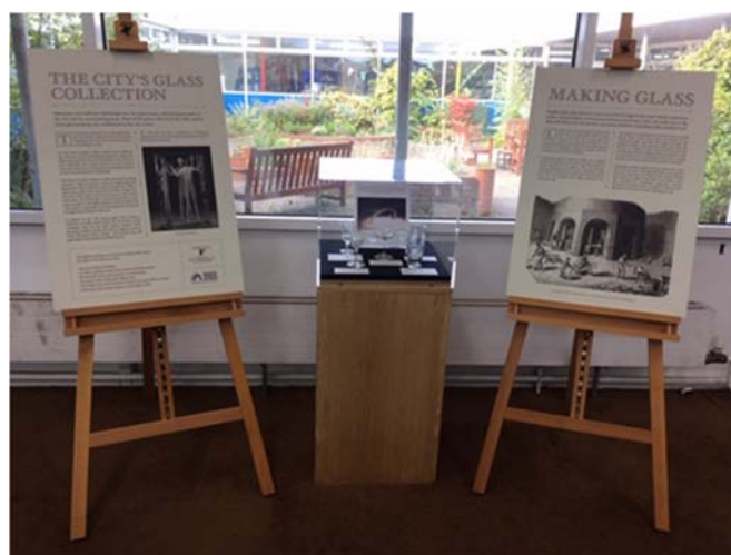
The glass display at Blackhall Library

The display is currently at Corstorphine Library, and will tour around the city to Colinton, Oxbgangs, Newington and Kirkliston Libraries.